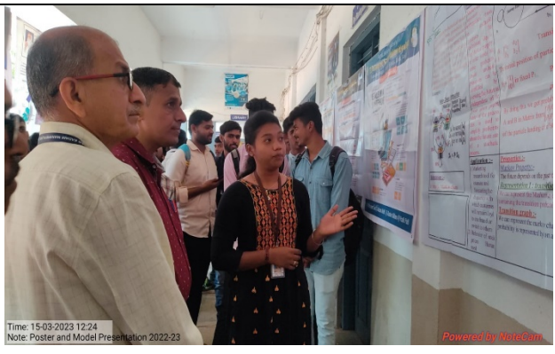
Examiners when examining the exhibition